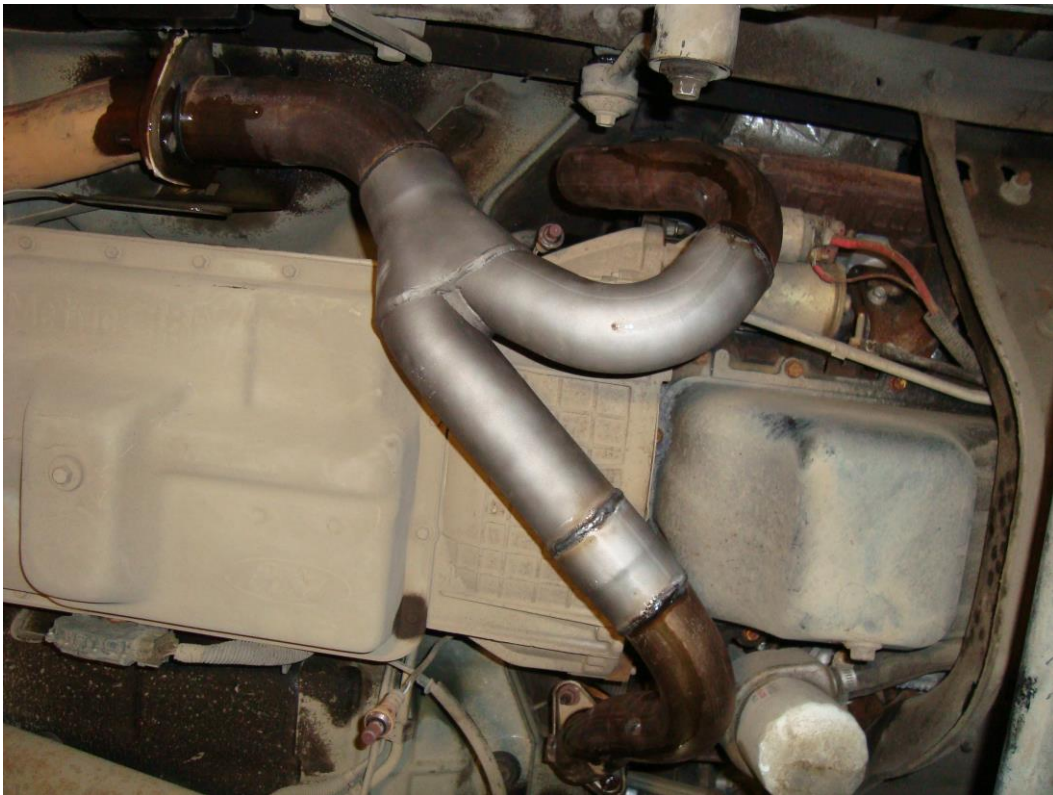
Step 4. Weld in your SPD y-pipe and enjoy your increase in HP, Torque and MPG's!